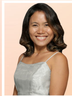
Gene Thoene Community Service